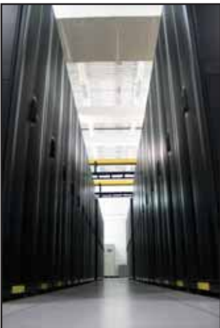
Our DFT facility located in Elk Grove, IL is one of the Midwest's most sophisticated and efficient data centers.

ServerCentral is better able to serve financial, healthcare, government and other organizations that are required to substantiate adequate oversight of their service providers. The audit reinforces our position among the world's elite data center operators, and validates to customers our willingness to take exhaustive steps to comprehensively support compliance requirements.