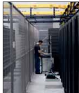
On-site, industry certified technical staff monitor and inspect data center facilities 24/7.

At ServerCentral, our goal is to provide superior customer service. We offer rapid response times and easy 24/7 access to our on-site, industry certified technicians to diagnose, troubleshoot, and repair equipment. For advanced requests, we staff senior IP engineering and system administrators around the clock. On-site part depots in our Chicago facilities help avoid timely parts procurement so that our staff can immediately swap out any failing equipment in an emergency. Trouble tickets receive immediate response and resolution.