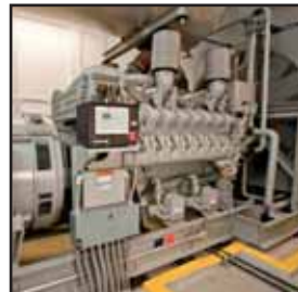
Diesel generator systems supply standby power.

Fully equipped with redundant systems and multiple power distribution paths, each of our facilities surpass Tier III ratings. In other words, your equipment will always be powered in its optimal operating environment. Our industry-leading 100% uptime service level agreements (SLAs) on power and bandwidth guarantee against costly downtime.